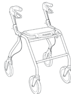
FUTURA 680 Art no. 12076-43-21