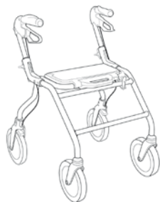
FUTURA 520 Art no. 12072-43-21