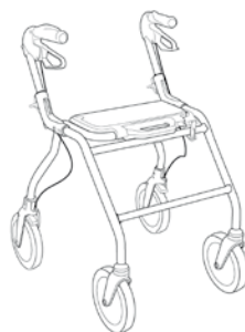
FUTURA 600 Art no. 12070-43-21