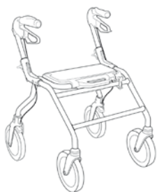
FUTURA 450 Art no. 12074-43-21