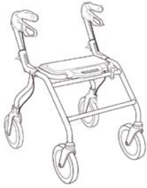
SYMPHONY 520 Art no. 12161