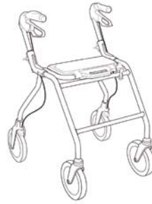
SYMPHONY 600 Art no. 12160